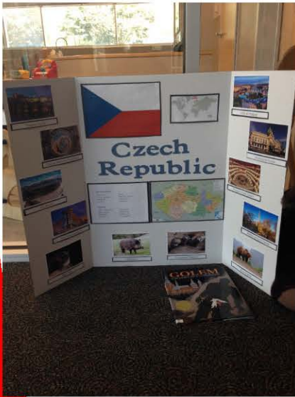
Infant 3 – Czech Republic