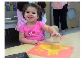
Early Preschool 3 student painting with a block wrapped in yellow yarn.

“Aa”. All of the students had the chance to taste apples! They also did apple prints and found the star in the middle of the apple when it was cut in half. Early Preschool 3 also learned “All About Me!” and studied themselves compared to their classmates. They made a chart to compare their heights and weights.