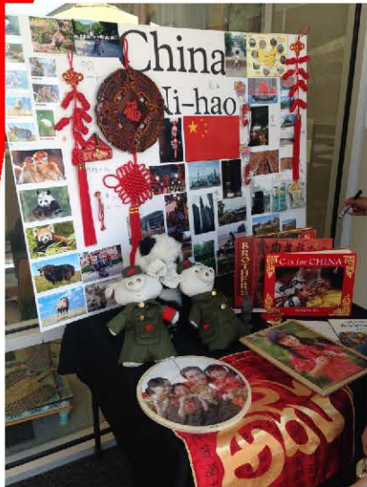
Preschool 1 – China