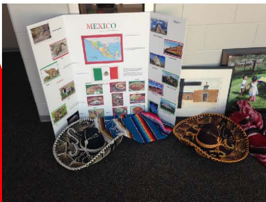
Early Preschool 3 – Mexico