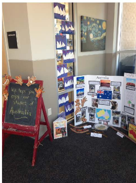
Kindergarten – Australia