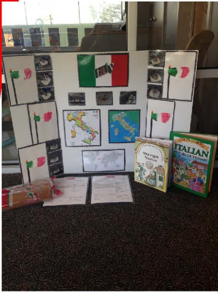
Infant 1 – Italy