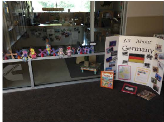
Preschool 2 – Germany