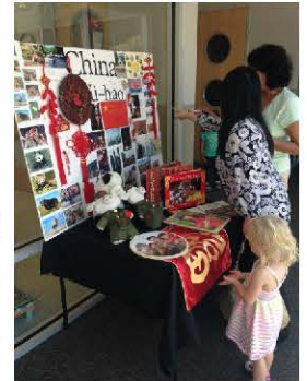
CCDC parent enjoying the World's Fair.

The world's fair took place on August 15th at CCDC from 3–5 p.m. Each classroom was assigned their own country. The students and teachers studied the countries and learned all about their flags, food, landmarks, people, animals, sports, holidays, and languages. Each classroom made a display board to tell all about their country. They also made a craft that went with their countries holidays or traditions to display with their information. The classes studied their countries by reading books, listening to music and talking to parents and children in the center that are from different countries around the world. The classes really enjoyed their studies and learning about the world around them!