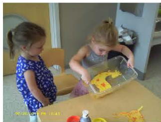
Preschool 1 students marble painting their zoo animals.

Preschool 1 had a busy August studying the letters "Yy", "Zz" and "Aa". As a group project, Ms. Cheryl's students created what they believed were yummy and yucky foods. They also observed a yoga instructor perform and participated in simple yoga poses and breathing exercises. The students also participated in a yogurt pop picnic and did yarn weaving. For letter "Zz" they discussed the difference between zoo animals, farm animals, and wild animals. The class also had zoo animal cutouts to marble paint on. To end the month of August, Ms. Cheryl and her class did activities to reinforce the letter "Aa". They did apple printing, finger painted on apple cutouts, tasted a variety of apples, and as a group they made applesauce and had it for a snack!