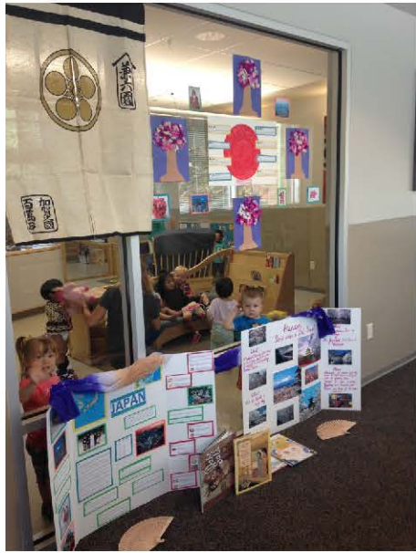
Toddler 3 – Japan