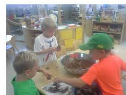
Kindergarten students making their Tim Tams.