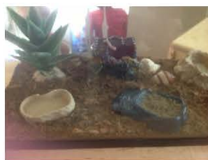
PreK 2's male hermit crabs.

to make Indian food to share for the Fair. They worked hard on the letters "Yy", "Zz", and "Aa". They are studying the new animals in their class and keeping a close eye on the them. The boys are also taking turns taking care of the pets!