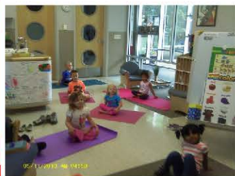
Preschool 1 students practicing their yoga positions and breathing.

ing, finger painted on apple cutouts, tasted a variety of apples, and as a group they made applesauce and had it for a snack!