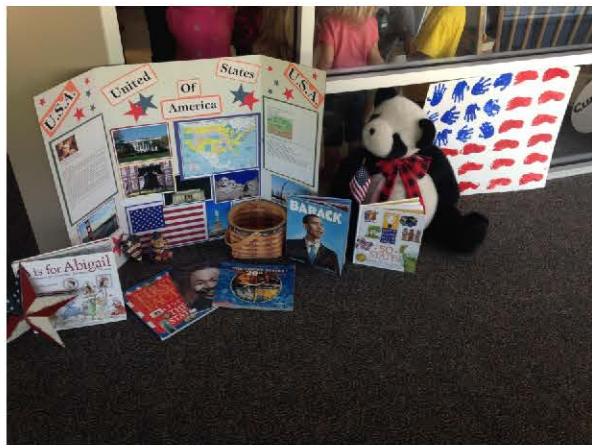
Early Preschool 1 – United States of America