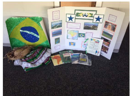
Early Preschool 2 – Brazil