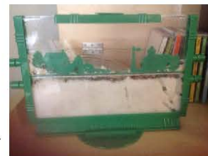
PreK 2's male worker ant farm.