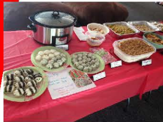
The food that the classes made was set up in the Commons for everyone to sample.