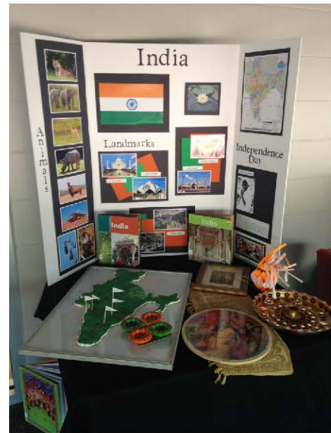
PreKindergarten 2 – India