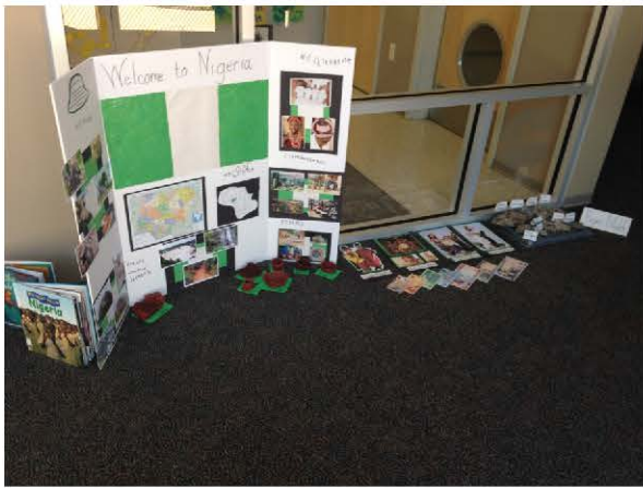
PreKindergarten 1 – Nigeria