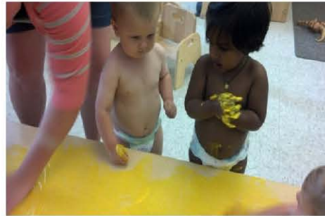
Toddler 3 friends body painting.