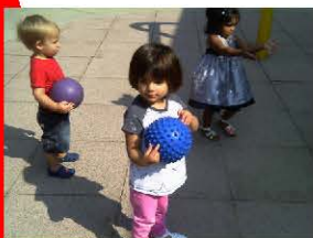
Early Preschool 3 students enjoying the beautiful summer weather!