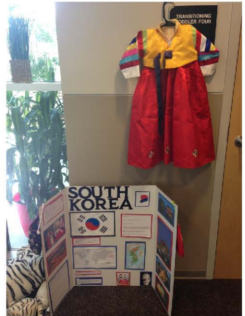
Toddler 4 – South Korea