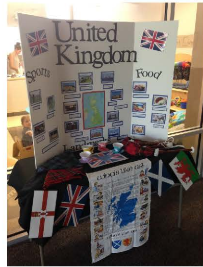
Infant 4 – United Kingdom