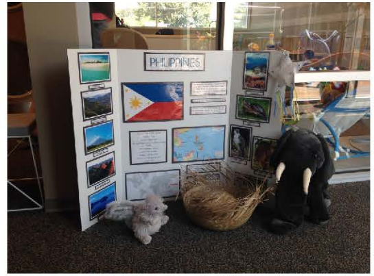
Infant 2 – Philippines