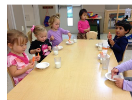
Early Preschool 1 students enjoying their snack.