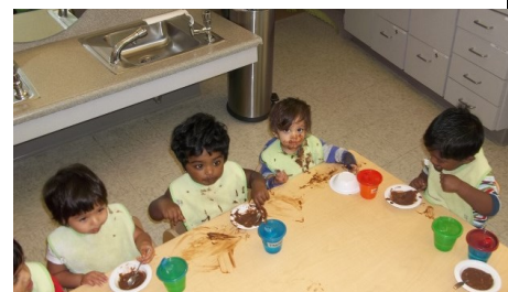
Toddler 4 enjoying their Zippity Doo Pudding.