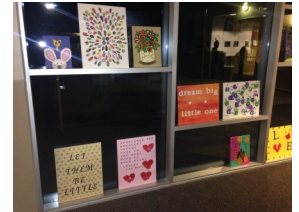
Art Auction Canvases

CCDC held our annual Bake Sale and Art Auction in September! The classrooms did an amazing job on all of the canvases and there were many contributions to the Bake Sale. Between the Bake Sale and Art Auction, CCDC was able to raise over $600 for 4 different charitable organizations: Special Olympics, Multiple Sclerosis Association, Cystic Fibrosis Foundation, and the Enlisted Association of the National Guard. Way to go everyone!