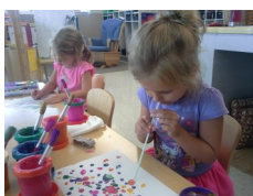
Kindergarten students blow painting.