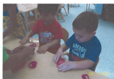
Preschool 2 student learning the alphabet with playdoh and cookie cutters.

Preschool 2 had a very busy month of September. Miss Donna and Miss Carrie are helping their students learn their letters by using playdoh and alphabet cookie cutters. Preschool 2 also participated in the CCDC Art Auction. Their design was a