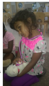
PreK 1 student doctoring her bear.

PreK 1 students were very busy with the letters "Bb" and "Cc" in the month of September. They started off by studying the life cycle of the butterfly. They listened to The Very Hungry Caterpillar being read by Eric Carle and also watched a play of the story. Their favorite part of letter "Bb" was having their Bear Hospital. Each child brought in their own bear and took care of them throughout the day. They gave their bears a check-up and also gave them a shot. The second week was spent studying different sports that used balls: basketball, golf, football, soccer, bowling. To end the week each child was able to bring in their own ball. They were very excited to play with them outside and share with their friends!