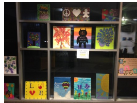
Art Auction Canvases