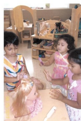
Preschool 2 students playing with the Beauty Salon dolls.