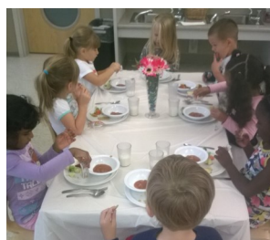
PreK 1 playing restaurant at lunch time.

At the end of the month they talked about their community and pretended to be different members of the community. They were construction workers, restaurant servers, mailmen, police officers and firefighters. They also played around with colors for letter "Cc", mixing, painting and being creative. PreK is also working very hard on their cutting skills and scissor safety rules. They love to cut and paste in PreK!