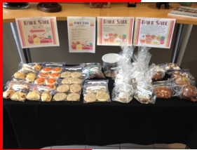
Bake Sale items displayed for purchasing.