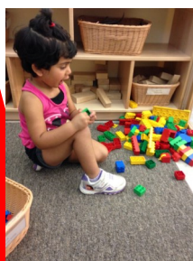
Early Preschool 2 student playing legos in the classroom.

Early Preschool 1 is in the spotlight for October! They had many exciting activities inside and outside last month. Ms. Megan and Ms. Desi planned a fun game for track time. They made a STOP sign and used green construction paper for the lights. When their teachers held up the green paper the students were able to run around the track and when they saw the STOP sign they had to freeze! The children loved it and it was also a great "following directions" activity. For an inside activity, the teachers wanted to reinforce the letter "Bb". Each child got a piece of bubblewrap to place in blue paint and stamp on paper. It was a fun and messy activity!