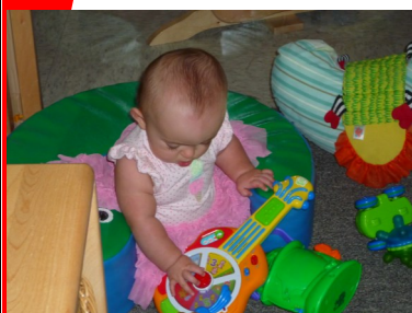
Infant 4 student enjoying free play with a guitar.

In the month of September, Infant 4 participated in the CCDC Art Auction by painting a hot air balloon with the saying "Adventure is out there". Also in their busy month they focused on reading and music. The babies