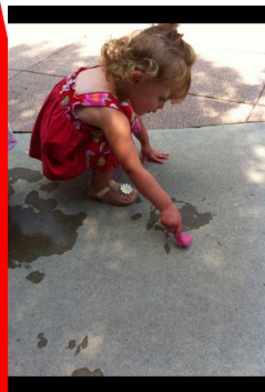
Early Preschool 1 student painting with water.