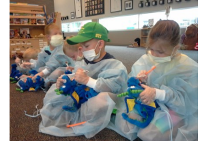
Kindergarten students working on their dragon dental patients.