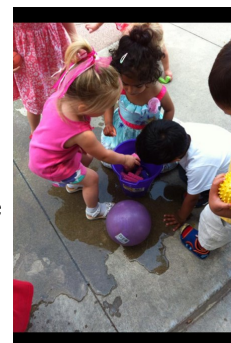
Early Preschool 1 students playing in water.