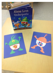
Aliens Love Underpants book with some of the aliens.