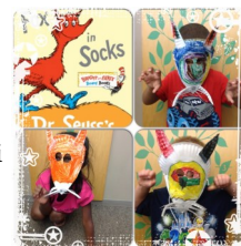
Pre-K 2 students posing with their fox masks.