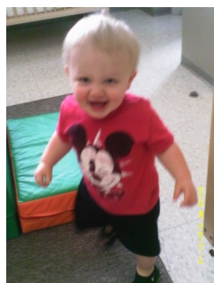
Infant 1 student playing in the classroom.