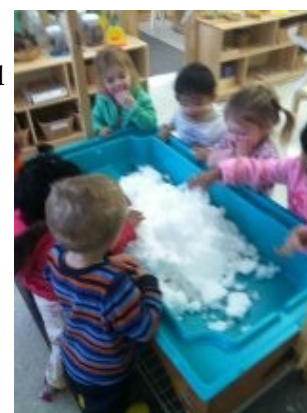
Early preschoolers play with snow in the sensory table.

In keeping with their winter theme, the class did a snowman craft. Teachers gave the kids the pieces to make a snowman, but the kids had to put together the snowmen by themselves. The class also painted snowflakes with pine needles, made penguins with their footprints, decorated a Christmas tree, made stamps with cookie cutters and played musical chairs with Christmas songs.