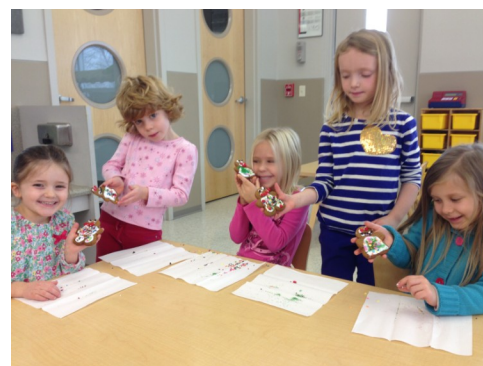
Kindergarten girls get ready to taste their cookies.