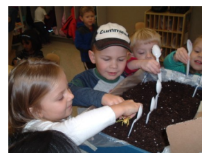
Pre-K 2 students planting a spoon garden.

science experiments and art projects. For the letter "G" students made a spoon garden, experimented on gummy bears, made gumball machines and told stories and shared photos of their grandparents. For the gummy bear experiment, Pre-K 2 soaked gummy bears in water, salt water and vinegar. The next day, they found that the gummy bears in water and salt water swelled, while the gummy bears in vinegar nearly dissolved.