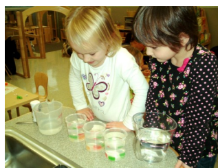
Pre-K kids experiment on gummy bears.

For their grandparents show and share, students shared pictures of their grandparents and told what they liked to do with their grandparents. Miss Julie displayed pictures of the kids with their grandparents on their classroom board.