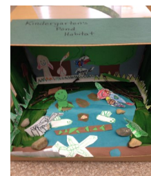
Kindergarten's pond diorama!

Thanksgiving and learned about the Pilgrims traveling on the Mayflower and starting their lives in America. They also chose five things they were thankful for and wrote them on feathers to make a classroom turkey. They enjoyed a Thanksgiving feast as a class during snack time! Kindergarten was also busy studying the habitats that birds live in, and made a pond diorama full of plants and animals they drew, and rocks and sticks they collected outside.