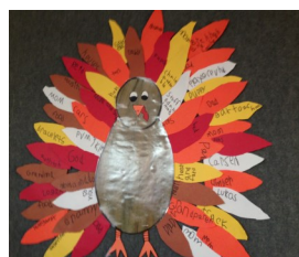
Kindergarten's "We are Thankful" turkey!

In the month of November, Kindergarten has been very busy learning! The letters "Ee", "Ff", and "Gg" have been reinforced and the children have been exploring and doing lots of activities. For the letter "Ee", they froze an egg and observed that the egg expanded as it froze. What a cool experiment! Each child created their own family tree while studying the letter "F". Each child's picture was very unique and represented their families. Kindergarten studied the first