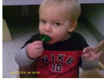
Toddler 3 student enjoying a freeze pop for a letter "Ff" snack!

Toddler 3 is in the spotlight for the month of December! They were very busy during the month of November with the letter "Ff". The students made freeze pops to enjoy for a fun "Ff" snack! They also made fans out of paper plates,