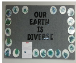
Preschool 2 students made their own Earth!

Preschool 2 enjoyed learning all about the letters "Ee", "Ff", and "Gg" during the month of November. The class made eagles out of the letter "E" and they also studied the planets and our Earth! Students even made their own Earth to hang on the display board in their classroom. They painted both "E"'s and "F"'s as a Fine Arts activity but for the letter "F" they used feathers!