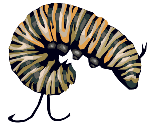
Early Preschool 3 students observed caterpillars.