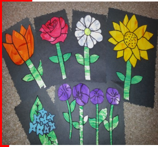
Infant 3 flowers for their letter "F" documentation board.

The infants in Infant 3 are learning more and more everyday with Ms. Michelle and Ms. Erin! 3 babies in Infant 3 already eat table food and are working on drinking out of a sippy cup. Wow!! The babies painted different flowers