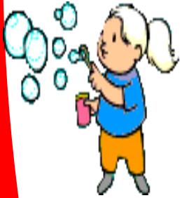
Infant 3 loves blowing bubbles!