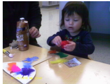
Toddler 3 student making her fan with feathers.

of the result! To celebrate Thanksgiving all of the students made cards for the parents to wish them a Happy Thanksgiving Day!