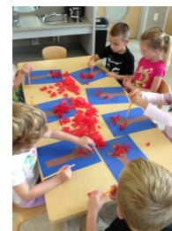
Kindergarten students matching letters on the trees.

The students have been working very hard learning their sight words and most of them are moving on to reading sentences!