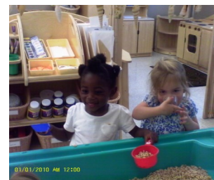
Early Preschool 2 students playing with Cheerios in the sensory table.