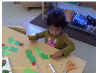
Preschool 2 student making a caterpillar.

Preschool 1 has had many activities in October reinforcing the letter "Cc". The students participated in several learning activities individually and as a group. The class discussed caterpillars and learned about the different stages of a caterpillar turning in a butterfly.