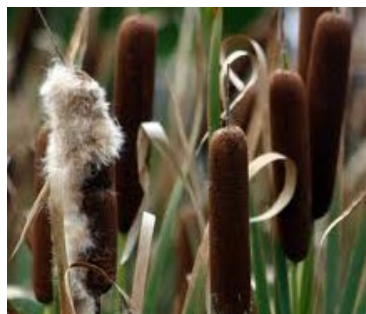
Cattails that the students dissected.