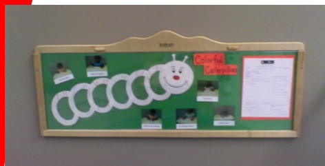
Infant 2 caterpillar board for letter "Cc".