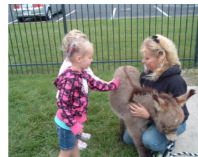
Pre-K 2 students petting the miniature donkey.

Pre-K2 is featured for the month of November. The classroom focused a lot on the letters "Cc" and "Dd". For letter "Cc" the students enjoyed camping activities that included listening to ghost stories in Ms. Tracey's tent, they went fishing for numbers, and pretended to roast marshmallows over a campfire. The class also made cotton candy cookies, planted carrots, and grew charcoal crystals. The theme of the classroom pumpkin was Charlotte's