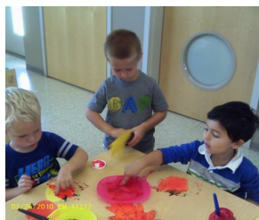
Preschool 2 students finger painting fall leaves and apples.

They also learned the four stages in sign language! Some of the group projects that the class did were bake cookies,