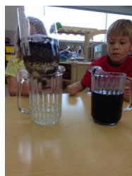
Kindergarten clean water filter experiment

Kindergarten also worked as a team to build a water filter. They made the filter in a 2 liter bottle by layering cotton balls, rocks, pebbles and sand. Before performing their experiment half of the class thought the water would still be dirty and half thought it would be clean. They were all impressed with how clear the water was after being filtered, including Miss Hannah!