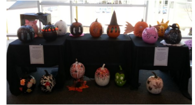
All of the classroom pumpkins that were created by teachers and students.

After the contest, the pumpkins were sold for $20 each to earn money for the teacher appreciation fund. The pumpkins sold quickly and parents loved seeing the work of all of the classrooms!