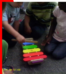
Early Preschool 2 students playing with musical instruments.

Early Preschool 2 was filled with art projects in the month of October to explore the different letters of the alphabet. The students created apples from their handprints for a fun fall activity. The class also did multiple sensory activities and food tastings in their room. They mixed shaving cream with food coloring to explore with their hands. Ms. Brittany and Ms. Jeannine also implemented a job chart in their classroom to encourage and promote independence! In the mornings they also started show and tell to get the students to talk to their peers and explain the objects they bring in to share. The class also started doing morning exercises to get ready for their day!