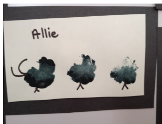
Preschool 2 student's marching ants.

Preschool 2 was as busy as B-B-B-Bees in September! They made home made bread and also made butter to add to the bread. One of their art projects was making bats out of toilet paper rolls and construction paper. When you are walking by or into their classroom you can hear them singing "Zippity Do Da", "Little Red Caboose", or "John Brown"! When they studied the letter "Aa" the students discovered that they loved the song