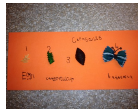
Butterfly life cycle made with pasta by Pre-K 1.

Pre-K 1 had a lot of fun with letters "Aa" and "Bb" in the month of September! With letter "Aa" the students learned about astronauts and even made themselves into an astronaut. As a class they also discussed aquariums: what lives in an aquarium and also made their own aquarium with fish, seaweed, shells and puffy paint for water. Miss Kristi also had the students make Autumn cupcakes to enjoy for snack and sell at the Starving Artist