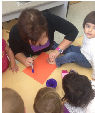
Toddler 1 student stamping her foot to make a butterfly.

butterflies for the letter "Bb". Their class was able to choose a color of construction paper and also chose the color of paint that they wanted to use. The teachers painted the toddlers feet to make the butterflies and they loved it. The toddlers also liked making their own choices to make their butterfly unique with the colors they chose!