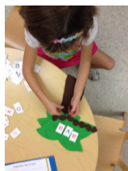
Kindergarten student using the Chicka Chicka Boom Boom trees to spell words.

During September, Kindergarten studied jobs that adults have. They looked at what people need to do for the job, what they need to wear and what materials they use. Each Kindergartener chose a job they would like to have when they grow up and wrote about why they would like to have that job. They also drew a picture of themselves doing their future jobs. They have a class full of future teachers, police officers, fire fighters, nurses, doctors, vets, pilots, and zookeepers!