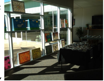
Classroom canvases and baked goods set up in the front lobby.