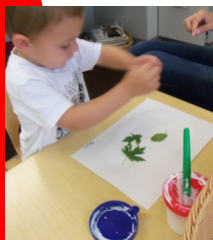
Early Preschool 1 student gluing leaves for the nature collage.