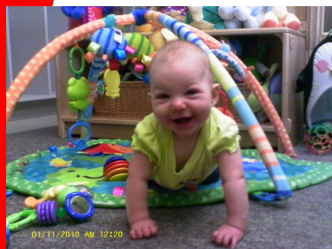
Infant 1 student pushing herself up.

Infants in Ms. Nancy and Ms. Sarah's Infant 1 classroom were very busy in the month of September! They have four infants trying to crawl. Grunting, fussing, and slobbering are all involved in trying to get around. There is also one