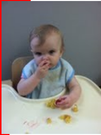
Infant 4 student tasting raspberries.

The babies in Infant four have been engaging in sensory activities. They made mud by adding crushed oreos to chocolate pudding. The kids loved the feel of it and of course the taste of it. The babies were also able to explore a real pineapple. The looks on their faces were priceless after tasting the pineapple. Now that the weather is changing, they are excited to be able to take the babies outside in a buggy to enjoy the fresh air and change of scenery. Last month they worked on activities that promoted physical development. They took the older infants out to practice walking with a walker. They also encouraged the middle aged infants to crawl to play gyms and other outdoor activities. With the younger infants, they sat them in worm seats and bouncy seats to help them strengthen their backs and develop better head control while they watch the older infants play. Since infant 4 has all girl babies they all were queens for a day. Infant 4 had of fun activities to do in the month of May.