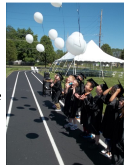
Graduating Kindergarteners releasing their white balloons after receiving their diplomas.

After the graduation ceremony, students performed a couple of special dances for their families that they had been working very hard to learn. When all of the graduation festivities were complete, the students and their families moved under the white tent to enjoy a catered meal from Puccini's and a graduation cake from Take the Cake. We are so proud of all the graduates and wish them, and their families, lots of luck in their future!