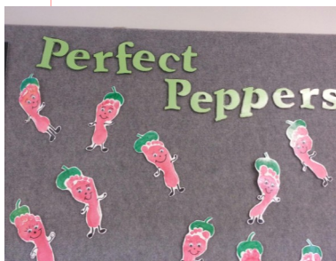
Perfect Peppers made out of the students' feet.

This month in Preschool 2 they've been doing a lot of awesome things! They learned a lot of things during 'P' week. They made peppers by using their feet. The preschoolers got to paint their feet red and shaped their footprint into a pepper by adding feet, hands, a face and a stem. For another activity, they took pickles and made pickle prints using all different colors of paint! They also got to use their 5 senses with a pickle. The preschoolers predicted what they thought the pickle would taste, feel and smell like. After their predictions, they got to try it out. They were very surprised at the taste of the pickle. They even asked for more! For Q week, the preschoolers made their own classroom quilt! They had lots of exciting things going on last month! Preschool 2 also welcomed 2 new friends to their classroom: Eli McIntier and Garrett Per-