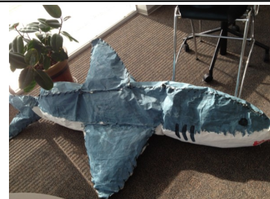
Kindergarten's life-size shark that they made during their Ocean study.

Kindergarten students had a lot of work and a lot of play in the month of May. The Kindergartners have been working on a big Science unit that consists of learning all about the ocean! They have studied and researched all of the plants and creatures of the ocean. One of the students favorite parts about the ocean were the sharks, so they decided to make a life size shark! The shark is 10 feet long and made of paper and sewn together with yarn. The Kindergartners hope to see their masterpiece displayed in CCDC soon! In the month of May, Kindergartners have also been learning about the letters P, Q, and R. For letter Q the students got to make their own classroom quilt! Each student brought in a piece of fabric that described their personality, they cut the fabric into squares and sewed them together to make a quilt. Kindergarten also graduated from CCDC on May 24th. Way to go students!