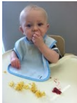
Infant 4 student tasting raspberries.

The babies in Infant four have been engaging in sensory activities. They made mud by adding crushed oreos to chocolate pudding. The kids loved the feel of it and of course the taste of it. The babies were also able to explore a real pineapple. The looks on their faces were priceless after tasting the pineapple. Now that the weather is changing, they are excited to be able to take the babies outside in a buggy to enjoy the fresh air and change of scenery. Last month they worked on activities that promoted physical development. They took the older infants out to practice walking with a walker. They also encouraged the middle aged infants to crawl to play gyms and other outdoor activities. With the younger infants, they sat them in worm seats and bouncy seats to help them strengthen their backs and develop better head control while they watch the older infants play. Since infant 4 has all girl babies they all were queens for a day. Infant 4 had of fun activities to do in the month of May.