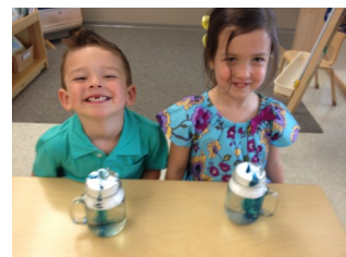
Pre-kindergarten two students learning about rain clouds through a science experiment.