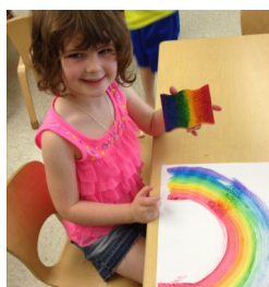
Pre-kindergarten one student with her finished sponge rainbow painting

PreK1 students also worked very hard on their Mother's Day surprises: they answered a questionnaire about their moms and made them a special keepsake box. Pre-Kindergarten 1 also worked on letter "Rr" in the month of May. They made rainbows by painting sponges and talked about recycling, reptiles, and respect in the classroom towards their friends and teachers. PreK 1 also welcomed many new friends to their class!