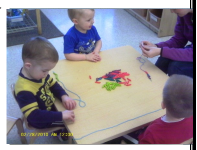
Early Preschool One students making colored noodle necklaces.

Early Preschool One students making monsters. joy running and playing with their new friends from