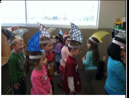
Kindergarten with their replica shark fins for underwater study.

Kindergarteners are practicing for 1st Grade and moving on to a new school! They had their first spelling test this month, are practicing their sight words, and Kindergartner working on a