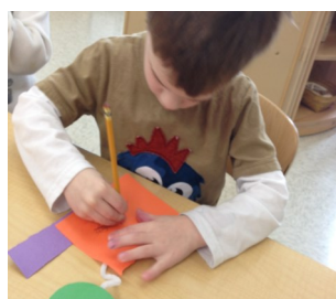
Prekindergarten 1 student making a jack-in-the-box