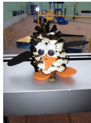
Early Preschool 2's penguin babies that are displayed in the center

Early Preschool 2 practicing their letters in shaving cream