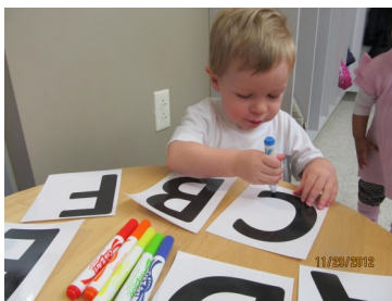
Toddler 2 student learning to trace his letters

job and their teachers are very proud of them. Keep up the good work Toddlers!