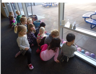
Preschool 2 checking on their ice globes through the window