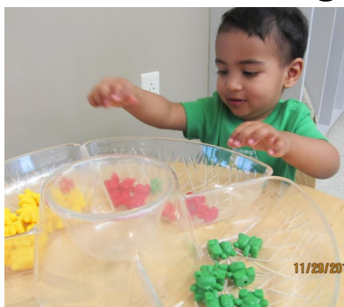
Toddler 2 student learning to sort by color