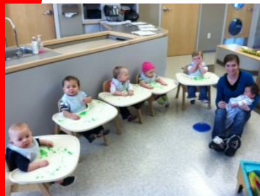
Infant 1 students getting ready to experiment with jello

In the month of January, Infant 1 had many activities going on! They have been experimenting with new foods, helping their babies prepare for toddlers, and getting used to table food and eating with their fingers! Infant 1 will send Logan Barringer