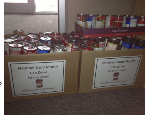
Boxes of cans in PreK 1 classroom

During the month of January, CCDC had a canned soup drive for our local charity, Love Chapel! Each classroom had a box placed in their room to have students donate. The reward for the classroom that collected the most cans was a pizza party! The center collected over 300 cans! The students were very excited about the competition between the classes and were very eager to find out who won! Each class kept track of their cans as more and more came through the door. PreK 1 and 2 kept track of their cans by counting them in groups of 10! The students loved counting and also got in an easy Math lesson! Early Preschool worked on pointing to each can as they counted their cans. The canned soup drive was a BIG success and CCDC would like to thank all the families who donated to this great cause!