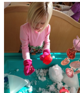
Prekindergarten student playing in snow in the sensory table

January has been a busy month for PreKindergarten 1! They have been studying the letters "Ii" and "Jj". For letter "Ii" the students made their own igloos with toothpicks and marshmallows. The students loved the activity and of course loved eating the marshmallows! Like their other friends in CCDC, PreK 1 also made ice cream and enjoyed their sweet treat at the end of the day. For letter "Jj" the students made a Jack-in-the-Box with shapes