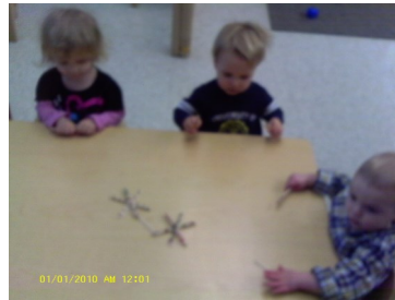
Toddler one students make snow flakes using popsicle sticks

learning Their numbers, shapes, and colors. They have a great group of children who are very willing to participate and learn new things.