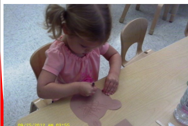
Preschool 1 students making a bear for b week

Gummy bears were a yummy snack for g week for the students to try. The class had a blast practicing and performing carols for their parents during their Christmas party. The students did a great job and were all smiles.