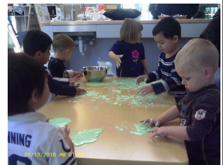
Early Preschool 1 students making and playing with green goop

waii... making leis, grass skirts, and hula dancing. They also got to hula hoop, make wizard hats, and horses out of the toilet paper rolls.