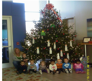
Toddler one students posing in front of the center Christmas tree

During the month of December Toddler One has been very busy working on crafts and learning new skills. They have been creating gifts for friends as well as their families. The holidays are upon us, so they have decided that they are going to make gifts for everyone in the classroom so our class can learn to be gen-