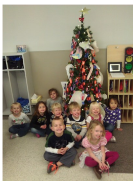
Prekindergarten 2 students posing in front of the tree they decorated

a secret gift exchange but when you teach pre-kindergartners secrets are not always kept. So in a few days most of the students knew who their secret Santa was. The class said goodbye to a friend who moved. The class completed a science experiment to see if they could blow up a balloon with out touching it. The class was successful in achieving this by using a bottle of vinegar and a balloon with baking soda in it.