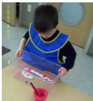
Preschool 1 student marble painting a candy cane