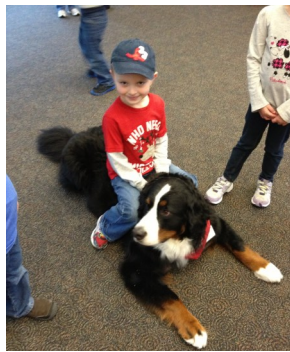
Pre-k student sitting on Bentley the therapy dog