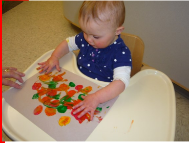
Infant 4 student finger painting a flower

This month the babies in infant four are hitting a certain age where they are becoming more aware of their environment and their surroundings. This month they focused more on music, movement, and communication by singing and dancing more often